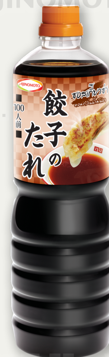
ซอสเกี๊ยวซ่า Gyoza No Tare